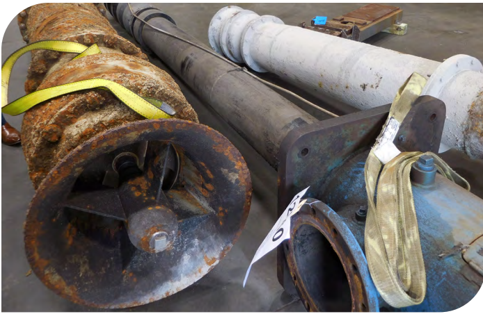
Repair Shop at Tencarva