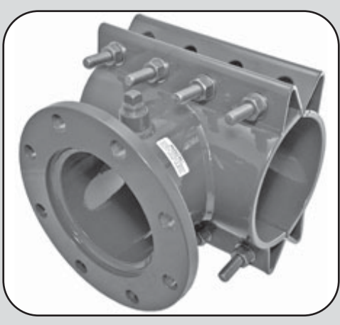
632 Tapping Sleeve