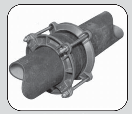
274 Bell Joint Clamp