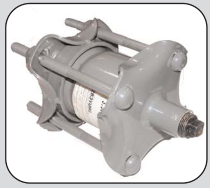
EZB Line Cap