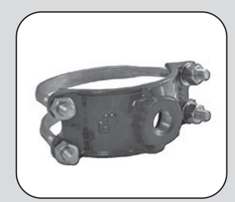
314 Service Saddle