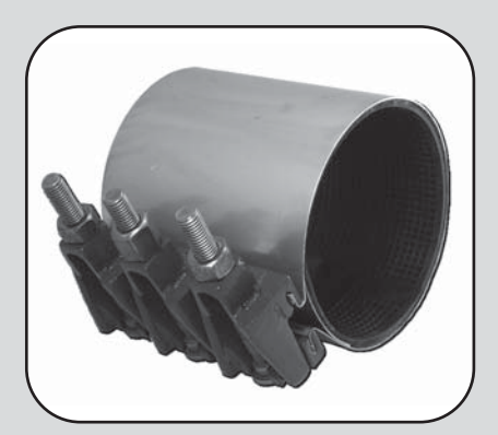
225 Full Circle Repair Clamp