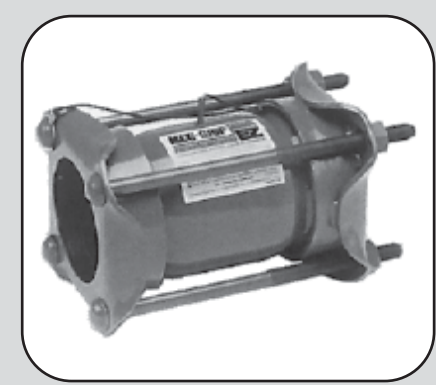
EZ Restraint Coupling