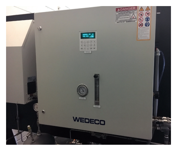
GSO 30 Ozone Generator from Wedeco, a Xylem Brand.