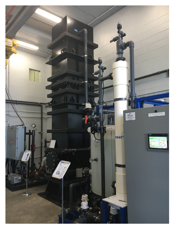
Biofiltration column from Leopold, a Xylem Brand that includes XA Underdrain and IMS 200 Media Retainer.

Altamonte Springs frequently conducts educational tours at the pureALTA facility, hosting groups ranging from middle and high school students to water utility personnel from around the country.