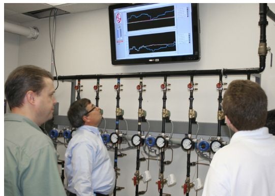
System balance demonstration.