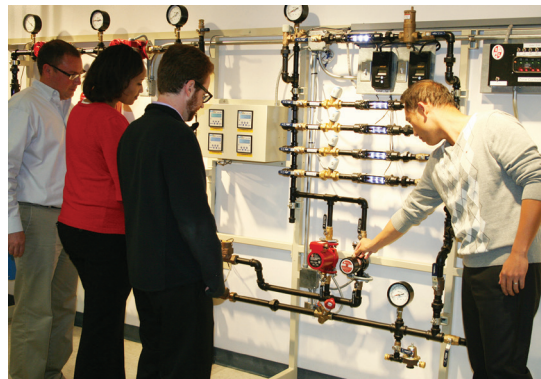
Primary-Secondary pumping demonstration.