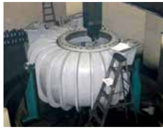
Restoring the fit, flatness and parallelism of the feet and casing faces on the casing and suction nozzle from a 66 x 48 WSYAV pump.