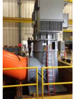
Preparing a 100 X 72 WCF Column pump for performance test in our Xylem 440,000 gallon test facility.