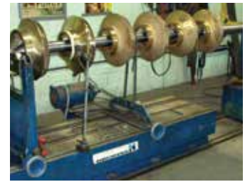
Balancing the rotating element for an 18 x 10 CDV 6 stage pump.