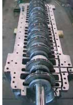
Rotating element and inner casing assembly lower half for an 8 x 8 BBDG-11 stage pump being trial fit to check floats and clearances.

Let us increase your pump reliability by minimizing forced downtime and high maintenance costs due to part failures.