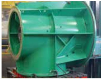
Restoring the registered fit and mounting flange flatness, and parallelism of a discharge elbow from a 102 x 72 WCA pump.