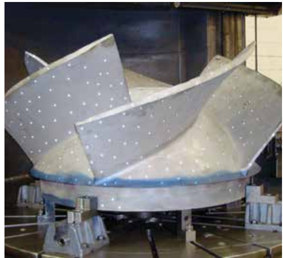
Data dots from a CMM dimensional check of an impeller for a 114 x 84 WCBR pump.

Pump Reconditioning: We'll restore your pump to its original equipment specifications with proper materials, improving performance, extending pump life, reducing operating costs and minimizing downtime.