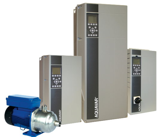
e-HM with wall mounted Aquavar IPC