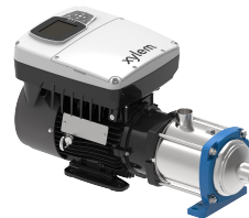
e-HMX Smart Pump

When compared to the e-HM with wall mounted Aquavar IPC, the e-HMX's integrated drive and motor reduces floor and wall space in a compact, easily serviceable pump package.