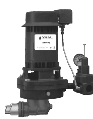
AW42 - Adapter is used to comply with State of Michigan requirements for enclosed suction line. It can be used as an offset adapter for 2" wells instead of using a well casing tee.