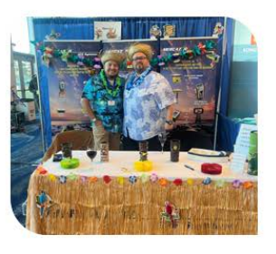
2<sup>nd</sup> Place Booth