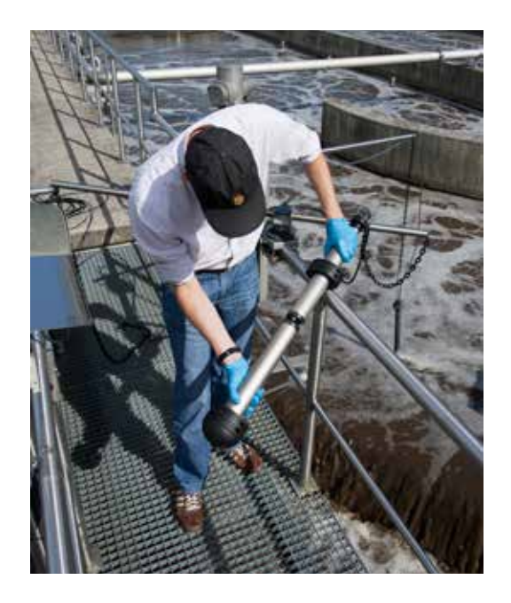
Figure 4. UV Vis sensors are low maintenance.

This system uses an air compressor to periodically force pressurized air over the optical windows, removing any solids that could disrupt the measurement. The WTW air blast system links directly to the sensor and is programmable within the controller to clean at a desired interval. Both automatic cleaning systems are capable of keeping sensors reading accurately for several weeks within wastewater applications.