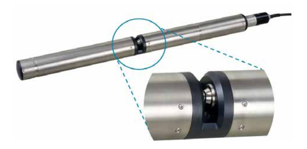
Figure 2. WTW UV Vis sensors have two available gap lengths, 1 mm and 5 mm.

Path length, or distance between the light source and detector, is important to the spectrophotometric measurement. Path length (aka gap width) is a factor in the calculation of absorbance according to the Lambert-Beer law and is affected greatly by the turbidity of the sample water. For that reason, UV Vis sensors usually have fixed path lengths and provide different gaps for specific applications. The IQ Sensor Net UV Vis sensors have 2 choices for path length: 1 mm and 5 mm (Figure 2). The 1 mm gap is for monitoring untreated wastewater and secondary treatment due to the high turbidity that is typical of these applications. The 5 mm gap is for monitoring treated effluent, wastewater with low turbidity, and can sometimes be adapted to some surface water or drinking water applications. Other manufacturers can have gap lengths of 10-50 mm gap lengths depending on the type of application. When choosing a WTW UV Vis sensor, choose the 701 style sensor for a 1mm path length (untreated wastewater or activated sludge) or the 705 style sensor for the 5 mm path length (low turbidity treated effluent).