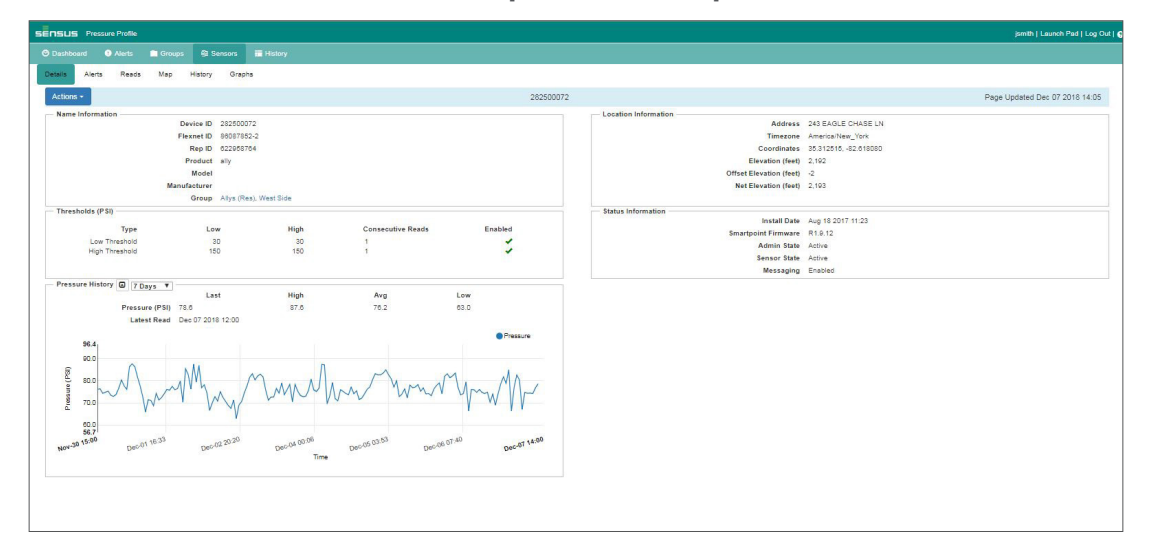
Customizable comparison of multiple sensors