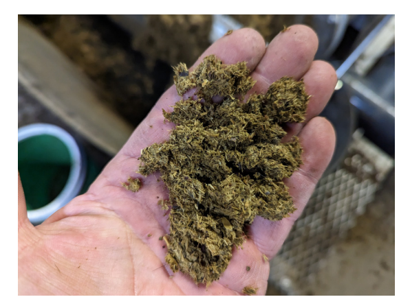
Feedstock Pre-Flygt Pump