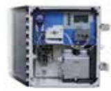
WTW Free and TR Chlorine Analyzer