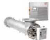
Wedeco UV Spektron