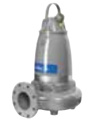
Flygt N-technology Submersible Pump