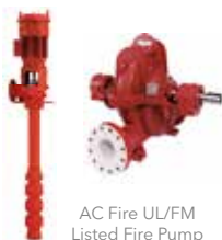
AC Fire UL/FM Listed Fire Pump

Supply water and maintain water pressure