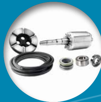
Ready availability of spare parts

Xylem is a leading global water technology company committed to solving critical water and infrastructure challenges with innovation. Our technological strength across the life cycle of water is second-to-none. From collection and distribution to treatment and reuse, our highly efficient water technologies, industrial pumps and application solutions not only use less energy and reduce life-cycle costs, but also promote sustainability.