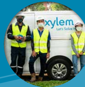
Service and maintenance post installation