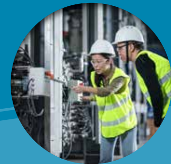
Training of operational staff