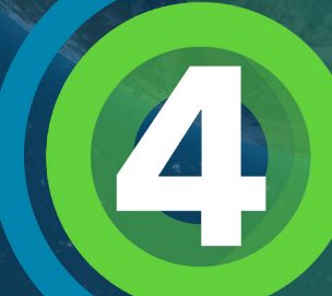
PLAN FOR THE FUTURE