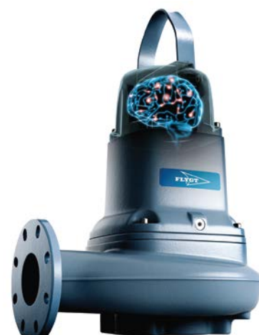
Flygt Concertor, a wastewater pumping system with integrated intelligence.