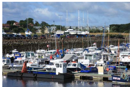
Amble Marina, located on River Coquet in Northumberland providing visitors with a range of marine-based activities.

Xylem Water Solutions UK Ltd Colwick Nottingham, NG4 2AN Tel 0115 940 0111 www.xylem.com/uk