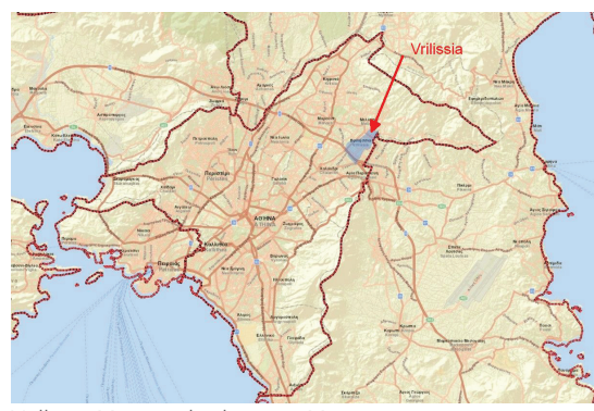
Vrillissia Municipality location Map

To address these issues, 8,000 old mechanical water meters were replaced with Sensus iPERL Smart Static Water Meters. An Advanced Metering Infrastructure (AMI) network was established through the installation of 145 Sensus RF Repeaters and seven Sensus Smart Gateways. This network covers 95% of the newly installed Smart Water Meters. For those meters outside the AMI network's coverage, readings are taken via a walk-by/drive-by solution, and the data is automatically integrated into the billing system.