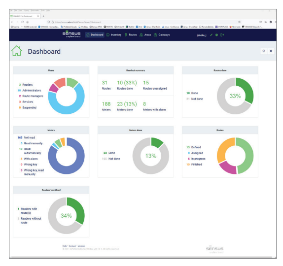
DIAVASO - The mobile reading app dashboard showing the meter reading status