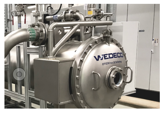
The Xylem-designed AOP system consists of two Wedeco PDOevo 900 ozone AOP systems, each producing 1,000 pounds of ozone per day.

Xylem, Inc. 4828 Parkway Plaza Blvd. Suite 200 Charlotte, NC 28217 Tel 704.409.9700 Fax 704.295.9080 855-XYL-H2O1 (855-995-4261) www.xylem.com