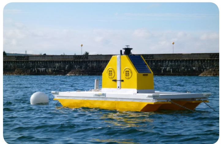
A YSI pontoon-mounted profiling system.