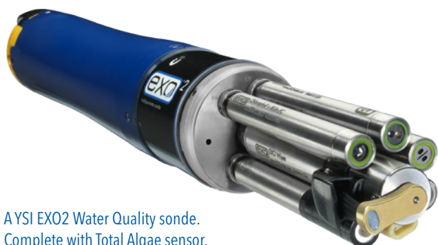
A YSI EXO2 Water Quality sonde. Complete with Total Algae sensor.