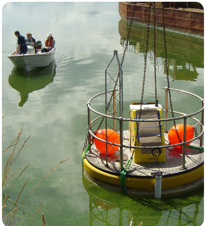
Preparing a floating water quality platform for installation.