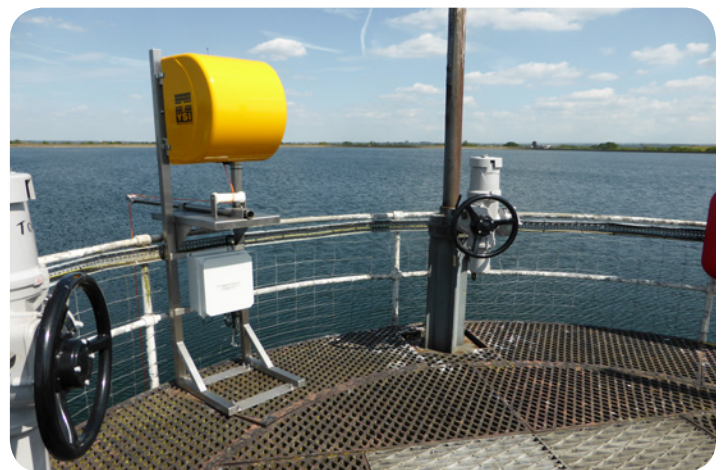
A YSI fixed-site profiling system.

"We have always wanted [a profiler] because knowledge of water quality throughout the entire column helps to improve decisions on water abstraction."