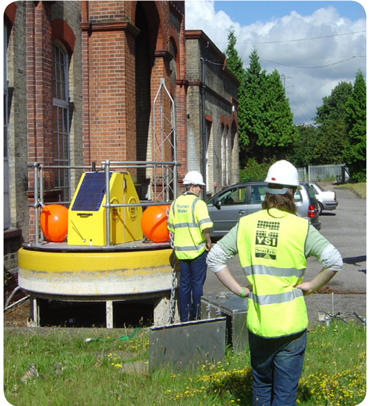
YSI also offers site selection, instrument setup, and maintenance.