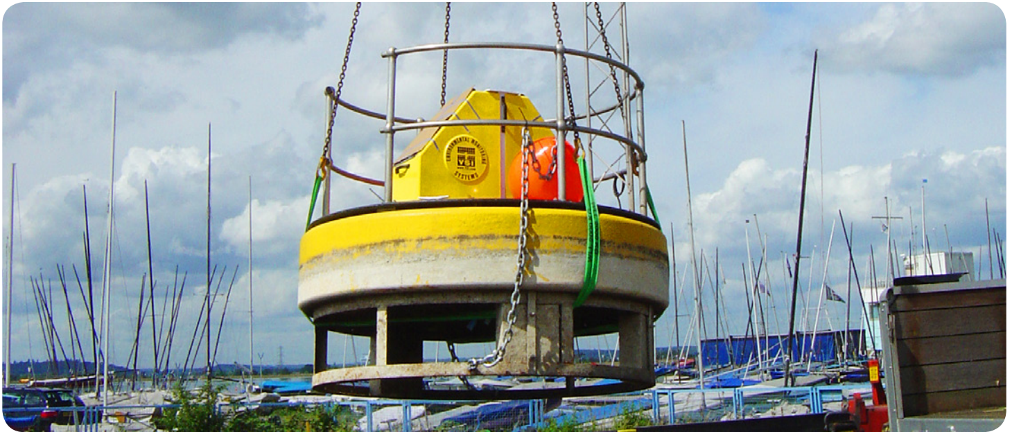
Deploying an autonomous profiling platform at the Thames Water reservoir.