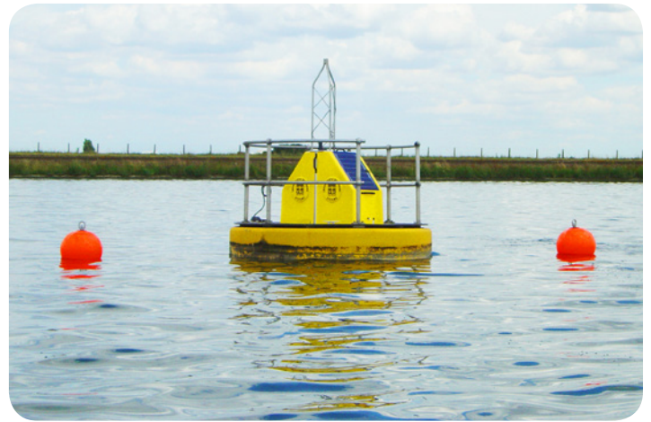
A YSI buoy-mounted profiling system.

The multiparameter sonde is automatically lowered and raised throughout the water column by a non-corrosive mechanical winch and drive mechanism located above the water surface. Data can be stored on the sonde's internal data logger and transferred by any of the latest communication technologies.