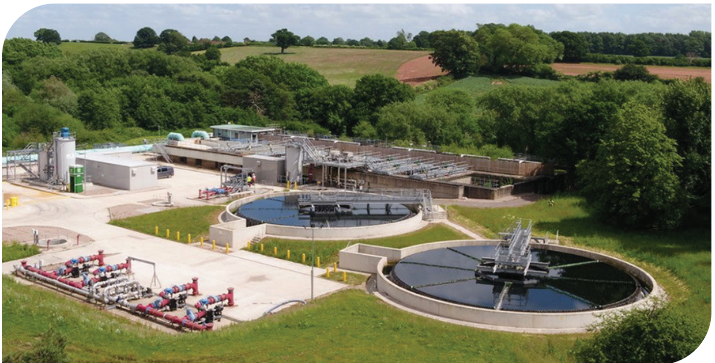
Ballasted clarification systems dramatically increase biological treatment capacity, helping meet ENR limits and produces effluent quality far superior than conventional alternatives, and at lower life-cycle costs.

With phosphorus recovery technology from Ostara Nutrient Recovery Solutions by Xylem, wastewater treatment facilities can do more than meet new lower limits for phosphorus: They can recover this valuable resource and return it to service as fertilizer.