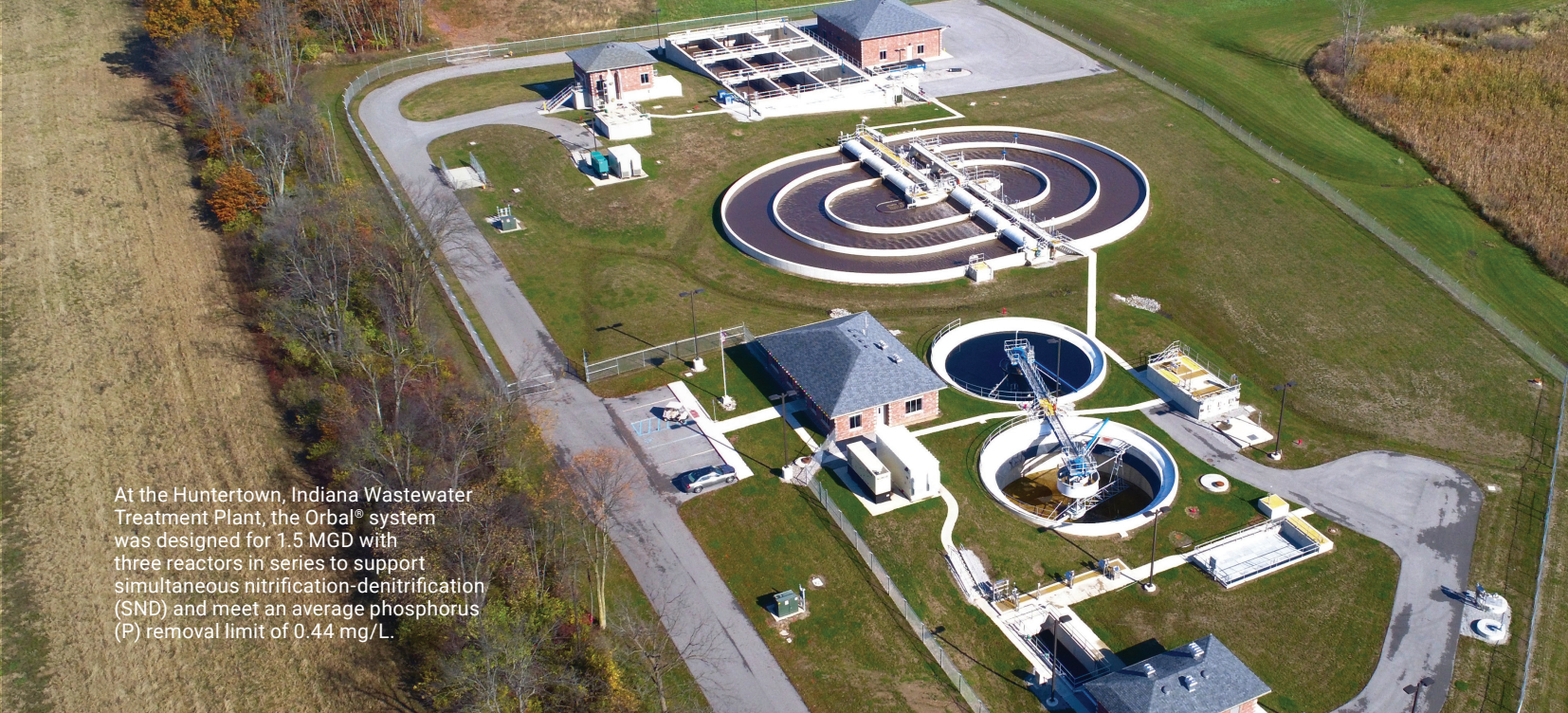
At the Huntertown, Indiana Wastewater Treatment Plant, the Orbal® system was designed for 1.5 MGD with three reactors in series to support simultaneous nitrification-denitrification (SND) and meet an average phosphorus (P) removal limit of 0.44 mg/L.