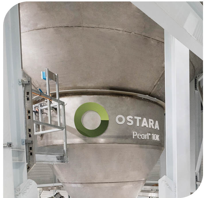
Ostara's Pearl® system is a nutrient recovery solution to help transform wastewater treatment plants into true resource recovery facilities

Crystal Green® fertilizer is only 4% water soluble versus ~90% water solubility for typical phosphorous fertilizers. This greatly reduces the runoff and leaching of phosphorous into our waterways and groundwater. The nutrients are accessible from acid release of the crop roots allowing the fertilizer to remain in the root zone longer, requiring less phosphorous application for greater crop yields.