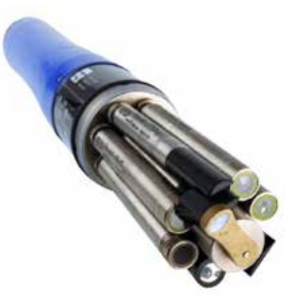
Multiple parameters for HAB monitoring can be bundled in the most advanced sensors by YSI.

In addition to alerting you to potential problems, ongoing monitoring allows you to look for trends and correlations between specific parameters. These are very site specific, so knowing how YOUR water supply responds to changing conditions yields huge benefits in being proactive, and maintaining control.