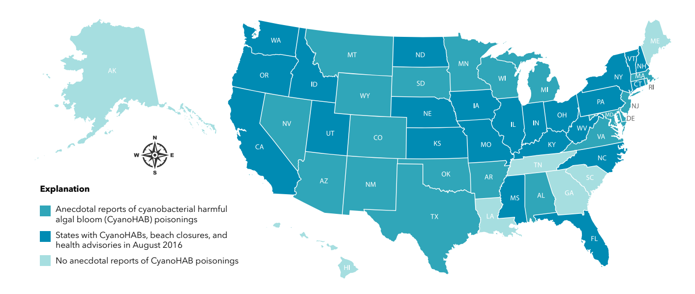
Figure 1: USGS reported CHABs August 2016<sup>5</sup>

Many types of algae can cause HABs in both freshwater and marine systems, but the freshwater cyanobacteria HABs (CHABs) have the highest potential to adversely impact drinking water systems. A survey conducted by UNESCO and published in 2005 confirmed that cyanobacteria occur throughout all regions of the world and in all the countries surveyed<sup>4</sup>. In the US, the USGS cites anecdotal reports of CHABs in 43 states in August 2016, leading to many health advisories and/or beach closings (Figure 1)<sup>5</sup>.